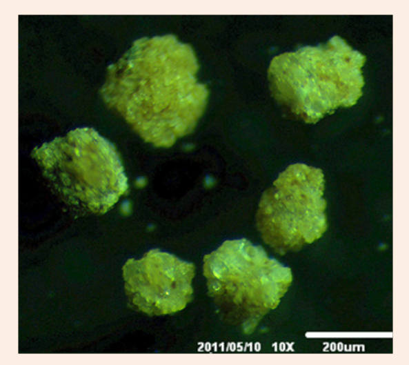
Figure 3: Microphotograph of selected dry extract (10x).

Selecting the best proportion of adjuvants : The excipients proportion used in run 8 (CSD 1.14 g and LM, 25.0 g), allowed achieving of a dry extract having good physicomechanical properties.